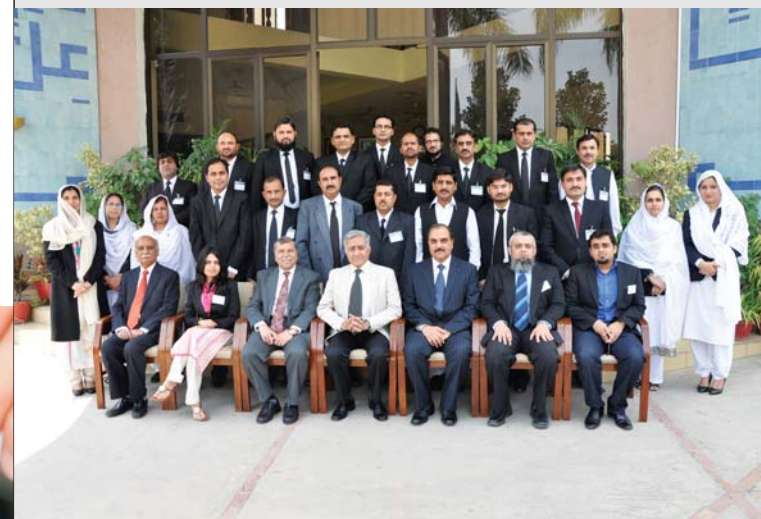
NCDR trains 21 Civil Judges from all provinces of Pakistan with the financial assistance of the Government of New Zealand.

Do not worry! We will still help you. Contact NCDR office and you may be eligible for a partial or full waiver. If you are not eligible you may still be allowed for easy payment methods at the Centre.